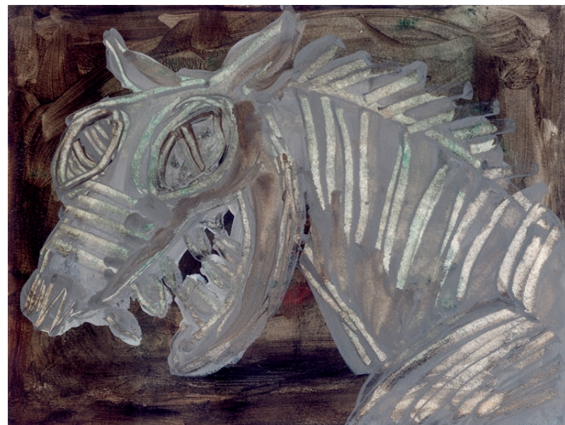
Pep Ramis, Hiena , 2006, drawing